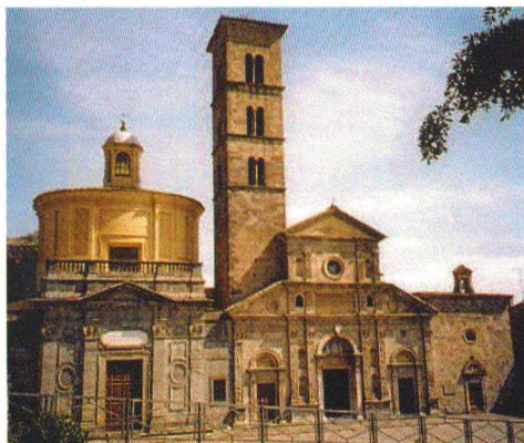
Bolsena Capella - directly across street from our base in Bolsena.

Spend your mornings learning from the experts, your afternoons writing or exploring nearby ancient ruins and hidden towns, and your evenings under the stars talking with fellow writers and our speakers, and savoring the flavors, sights and sounds of Italy.